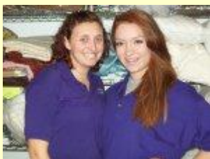
This month these two